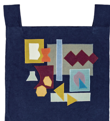
Monk Bag - Navy (collaboration with hoshi kana) Shot cotton, polyester thread on cotton bag 49cm×45cm (Strap measures 98cm)