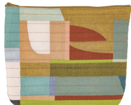
Zipper Bag (terracotta) Shot cotton, cotton batting, cotton/linen blend, polyester thread, notions 20cm×17cm