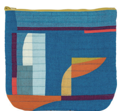
Zipper Bag (turquoise) Shot cotton, cotton batting, cotton/linen blend, polyester thread, notions 20cm×18cm