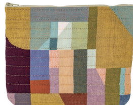
Zipper Bag (beige) Shot cotton, cotton batting, cotton/linen blend, polyester thread, notions 20cm×17cm