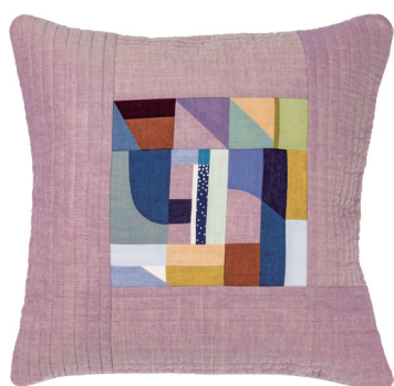
Cushion Cover (dusty pink) Shot cotton, cotton batting, cotton/linen blend, polyester thread 43cm×43cm