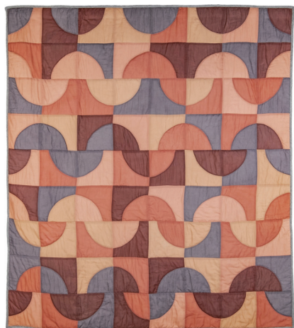
Movement Quilt Naturally dyed organic cotton (by KITTA), cotton batting, cotton gauze, polyester thread 137cm×155cm