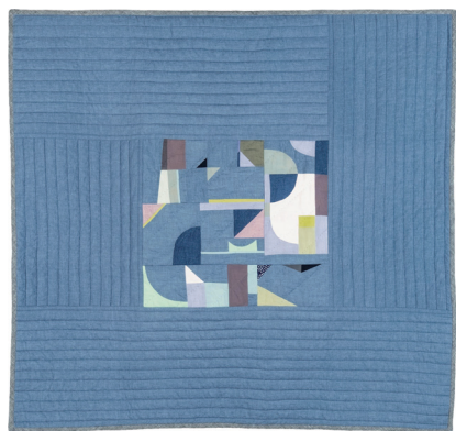
Disappearing Shapes (light blue) Shot cotton, cotton batting, cotton/linen blend, polyester thread 97cm×94cm