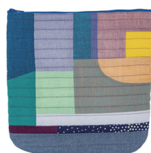
Zipper Bag (yellow) Shot cotton, cotton batting, cotton/linen blend, polyester thread, notions 20.5cm×20cm