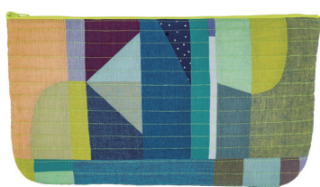
Zipper Bag (lichen) Shot cotton, cotton batting, cotton/linen blend, polyester thread, notions 30cm×17cm