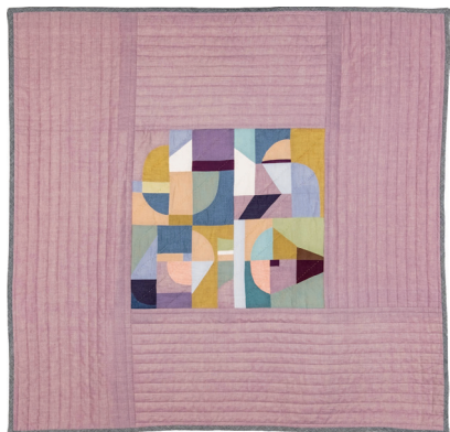
Color Moments (dusty pink) Shot cotton, cotton batting, cotton/linen blend, polyester thread 95cm×93cm