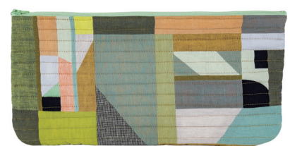
Zipper Bag (lime) Shot cotton, cotton batting, cotton/linen blend, polyester thread, notions 34cm×17.5cm