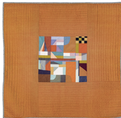
Checkerboard Quilt (orange) Shot cotton, cotton batting, cotton/linen blend, polyester thread 98.5cm×96cm