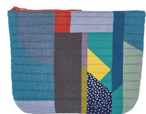
Zipper Bag (red) Shot cotton, cotton batting, cotton/linen blend, polyester thread, notions 21cm×17cm