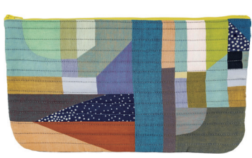
Zipper Bag (jade) Shot cotton, cotton batting, cotton/linen blend, polyester thread, notions 30cm×17cm