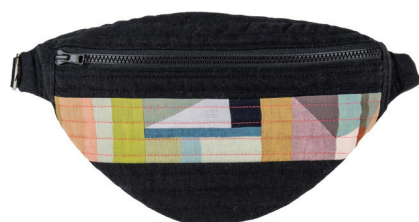
Waist Bag (black) Shot cotton, cotton batting, cotton/linen blend, polyester thread, notions 30cm×16cm (Fits waist 59-98cm)