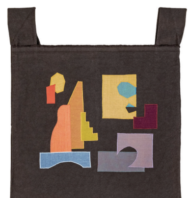
Monk Bag - Brown (collaboration with hoshi kana) Shot cotton, polyester thread on cotton bag 49cm×45cm (Strap measures 98cm)